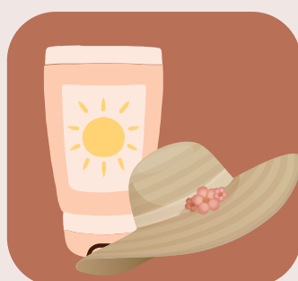
SUN CREAM & SUN HAT