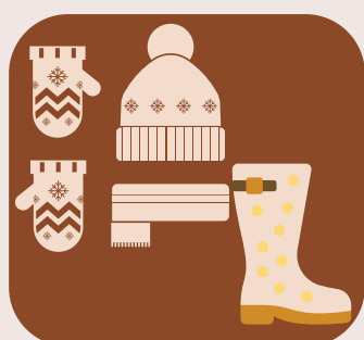
COLD & WET WEATHER CLOTHING

Please bring any comforters that your child may need e.g. blanket, sleep bag or muslin.